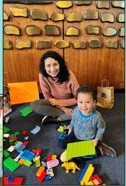
Purim Carnival Fun!