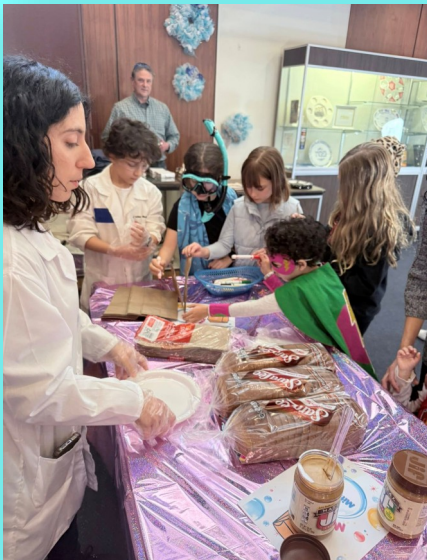
Making sandwiches for Crisis Center