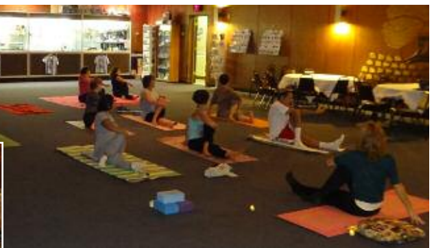
(Above) Class in session